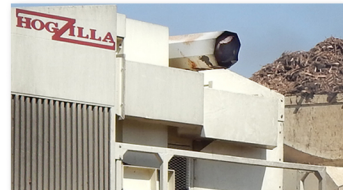
Custom Exhaust Covers

See separate sales information for details related to customer tub guard and backstop mechanisms.