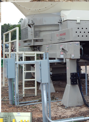
Custom Do It Yourself Clamp on Adjustable & Changeable Chain Rail Construction Kits are Available as Components or Complete Systems