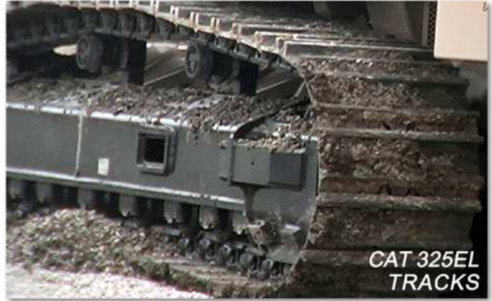
CAT 325EL TRACKS