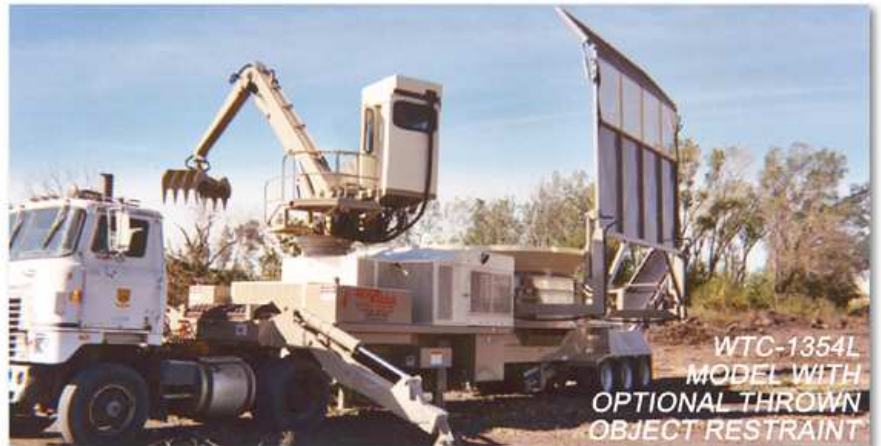
WTC-1354L MODEL WITH OPTIONAL THROWN OBJECT RESTRAINT

The WC series offer BIG machine performance in a medium size package. Models include Portable, Track Mounted and Knuckle-boom loader machines. The features that make HogZilla the preferred grinder for reliability and productivity are included in this smaller but very capable machine. Specify HogZilla for BIG Grinder performance.