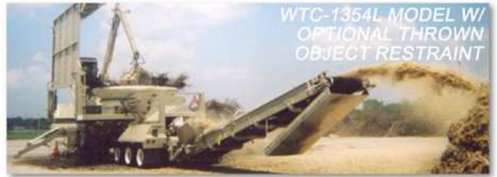
WTC-1354L MODEL W/ OPTIONAL THROWN OBJECT RESTRAINT