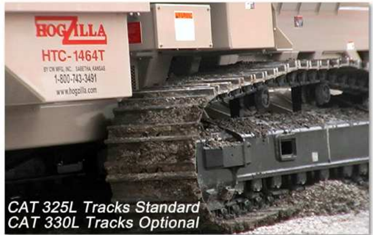
CAT 325L Tracks Standard CAT 330L Tracks Optional