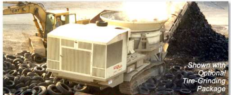
Shown with Optional Tire-Grinding Package

HUGE Precleaner for radiator and engine.