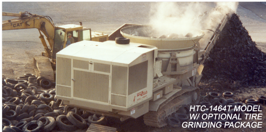
HTC-1464T MODEL W/ OPTIONAL TIRE GRINDING PACKAGE

The HC series grinders are built to be the most reliable high capacity grinders in their class. You can expect maximum production at the end of the day, be it acres, tons, or yards of material being ground. At 750 - 1050 horsepower and averaging 90,000lbs., the HC Series can handle your toughest jobs and last for years doing it. The power is delivered to the hammermill by Hydraulic Coupling or an optional Torque Converter Drive, which will multiply engine torque to the hammermill for even greater production.