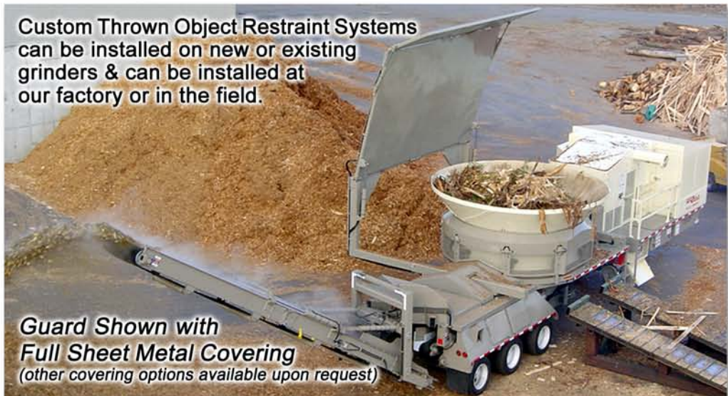
Guard Shown with Full Sheet Metal Covering (other covering options available upon request)

Custom Thrown Object Restraint Systems can be installed on new or existing grinders & can be installed at our factory or in the field.