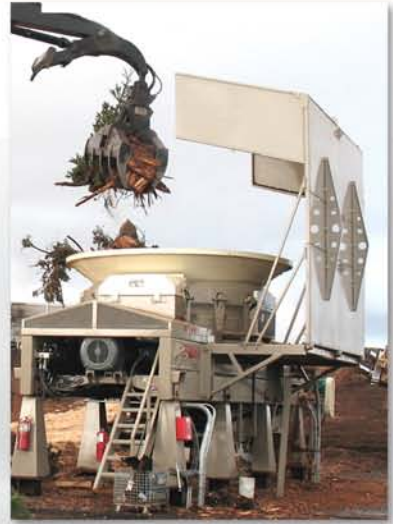
Rigid Stationary Thrown Object Restraint Systems are also Available

CW Mill Equip. has gone to great lengths to design numerous multifunctional Tub Cover & Back Stop options based on input from experienced grinding professionals. With varying job sites, applications, and loading methods, systems can be customized.